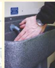
Delivery of hot water