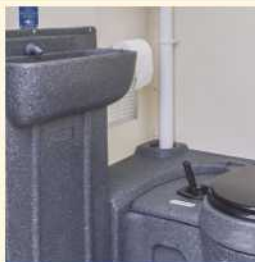
Toilet wash area