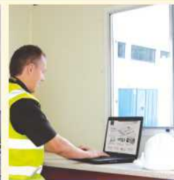
Separate office space